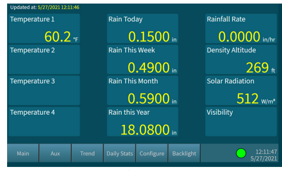
Aux Screen (parameters displayed depend on sensors)