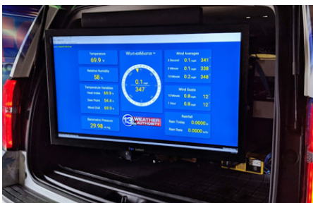
WeatherMaster software customized to display the 13WHAM logo.

Meteorological parameters are displayed on a monitor with CWS’s proprietary WeatherMaster™ Software . Johnson reports, “The display gives us an uncluttered easy-to-read view on the weather.”