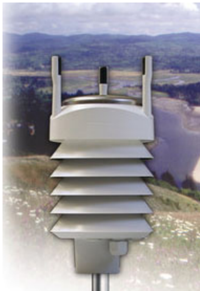
USEI utilizes the Orion Weather Station to “help comply... with important environmental regulations.”

With this change, the user can monitor the one-hour rolling wind averages through the MicroServer user interface, as well as Weather Master “Display” and “Trend” screens.