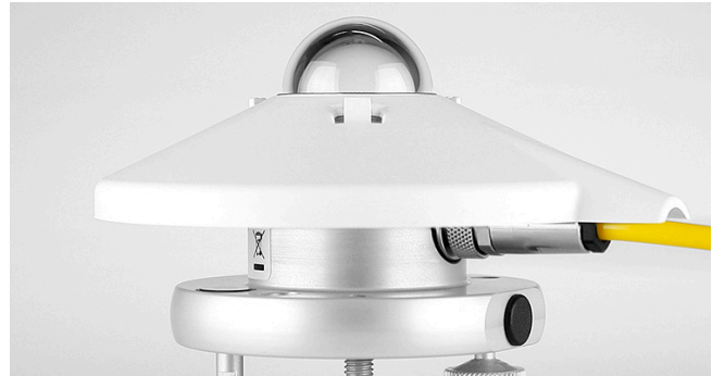
Part Number: 82603-6A

This thermopile sensor meets ISO 9060:1990 First Class requirements and features a sixty-four thermocouple junction sensing element. The sensing element is coated with a highly stable carbon based non-organic coating, which delivers excellent spectral absorption and long term stability characteristics. It has improved performance due to the increased thermal mass and the double glass dome construction.