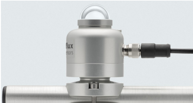
Part Number: 82605

This thermopile sensor meets ISO 9060 second class requirements. It measures solar radiation received by a plane surface, in W/m^2 , from a 180^\circ field of view angle. SR05 is ideal for general solar radiation measurements in meteorological networks and PV monitoring.